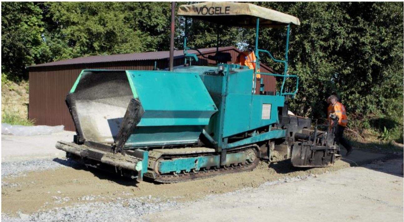
Fig. 2 Finisher machine.

This machine works by pouring material into the so-called basket. At the bottom of the basket are usually two belts in the shape of a ladder, which convey the material in front of the smoothing bar (iron). With the transverse helix this material reaches the entire span of the screed. Then the material is placed between the