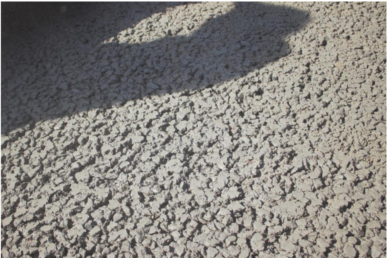
Fig. 5 Detail of pervious concrete surface with Dmax 16 mm.