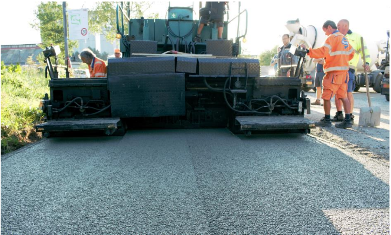
Fig. 4 Detail of pervious concrete surface with Dmax 8 mm.