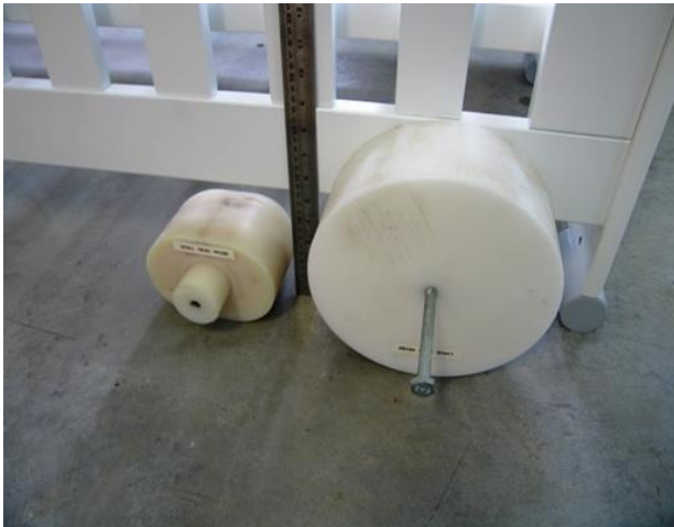
Fig. 3 Head entrapment on the outside of the cot.