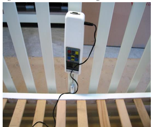
Fig. 2 Bed base and side frame gap measurement.