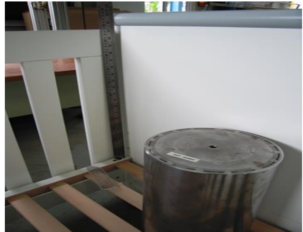
Fig. 4 Distance between footholds and top of cot sides.

the upper side must be measured. Children's cot base/mattress base and the top edge of the children's bed under load, must be at least 600 mm (Fig. 4).