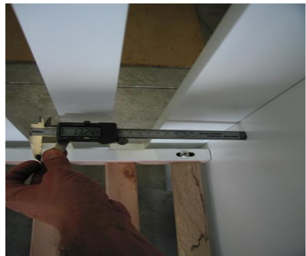
Fig. 1 Measurement of the assembling holes.

Figs. 1-4 show some of the most important tests performed during the tests and concern the measurement of the diameter of the assembly holes which should be within certain limits (Fig. 1), the measurement of the bed base in relation to both sides of the cot (Fig. 2), the possibility of head entrapment on the outside of the cot. In the openings on the outside of the cot, when the small head probe passes, the large head probe (Fig. 3) must pass, and the distance between