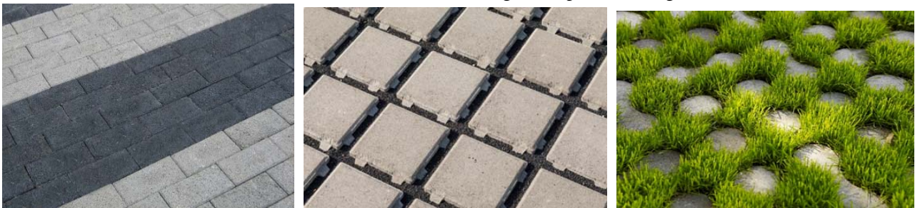
Fig. 1 porous pavers, pavers with wide joints, turf-slabs.

On a surface of 1 m 2 of permeable pavement consisting of concrete products and their jointing material or filling voids, under a constant load of 1 cm of water, the test consists of measuring the amount of water that infiltrates in a given time. The schematic diagram is presented Fig. 2.