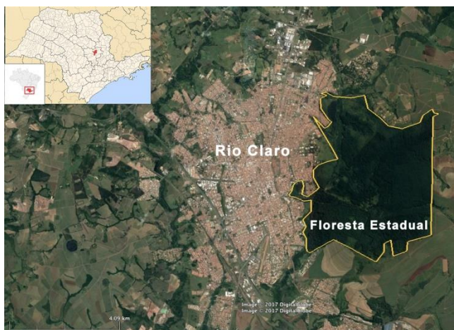
Fig. 1 City location of Rio Claro and limits of Floresta Estadual Edmundo Navarro de Andrade.

In the early twentieth century, researcher Edmundo Navarro de Andrade directed his research to find a solution to the forests that were being devastated for the use of wood as charcoal fuel in steam locomotives. His research came to fruition when the results of experiments with the use of the eucalyptus species, originating in Australia, proved to be the ideal species to use wood for reforestation and, later in consumption for charcoal (firewood), railway sleepers, and also the manufacture of wooden wagons, so FEENA was initially directly linked to the Paulista Railway Company [15].