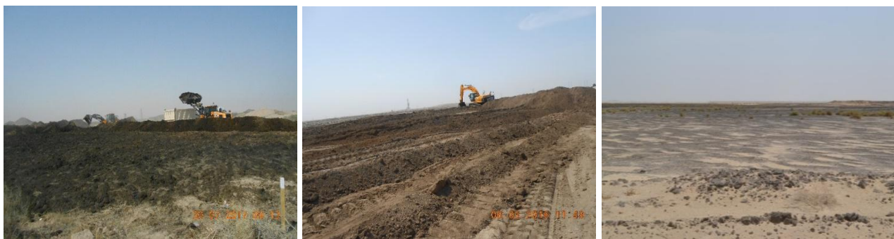
Fig. 2 Dry oil lakes.