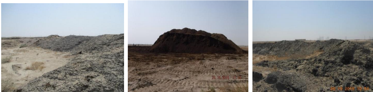
Fig. 4 Oil Contaminated Piles Features.