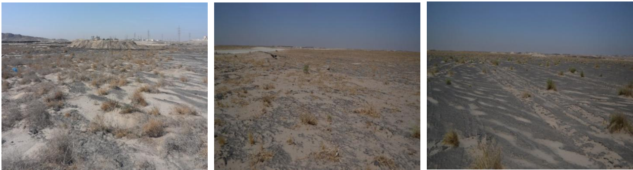
Fig. 3 Tarcrete features.

Wellhead pits are man-made excavated pits. The pits were constructed approximately 100 m-150 mm from previous oil wellheads and were created to either store sea water used to extinguish wellhead fires, or as a containment and storage area of released crude oil and associated contaminated soils, from vandalized or destroyed wellheads immediately following the Gulf war period.