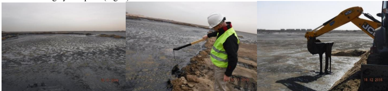
Fig. 1 Wet oil lakes.