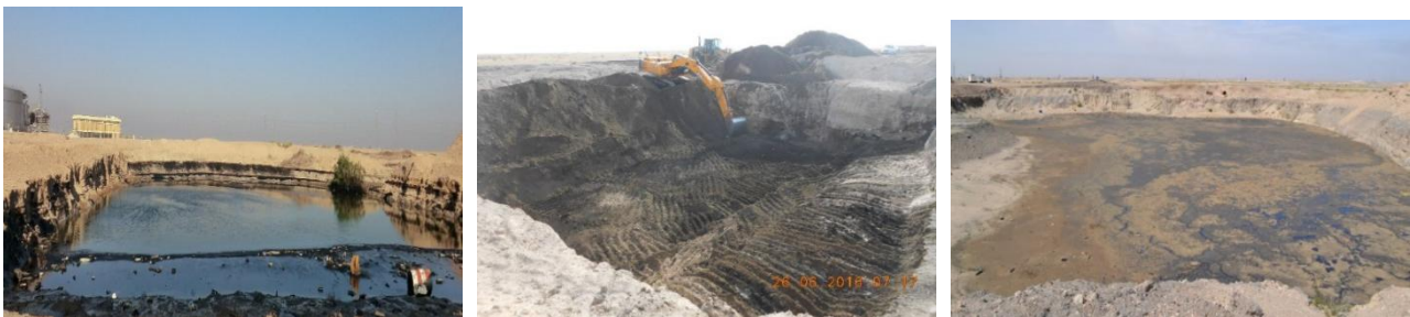
Fig. 5 Wellheads Pits.