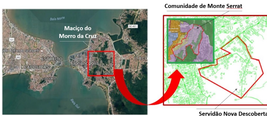
Fig. 1 Left: Maciço do Morro da Cruz view (red square), in Florianópolis, SC; Right: Monte Serrat community (green square) and Nova Descoberta Street (red polygon).

The study site selected for this research was a street called Nova Descoberta within Monte Serrat Community, one of the 18 tenements in MMC (Fig. 1). Nova Descoberta Street is in an environmentally vulnerable area, designated as a Limited Use Preservation Area (or APL in Portuguese acronym) by the Brazilian Forest Code.