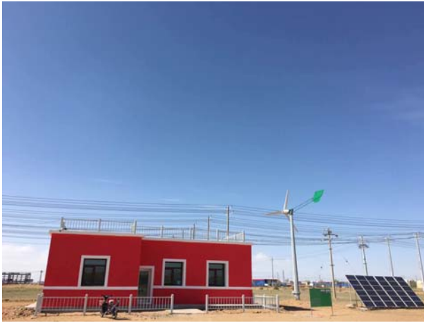
Fig. 1 BOYANG wind-Solar heating demonstration project in pasturing area.

source, in case continuous no wind weather happened in winter.