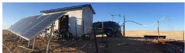
Fig. 3 Typical solar-wind water pump system in pastoral area.

Generally the deep of well in pastoral area is between 20 to 100 meters. In order to satisfy the herdsmen's water using demands, the system designed that can pump 10 tons of water per day and 2.5 tons per hour. The controller system and batteries are installed in a small room, the whole system are designed working between -30\text{--}+40^\circ\text{C} . Water level monitoring function was set in the water pump controller that can realize automatic water pump. When water level lower the value set up, pump protective device will start to prevent water pump overload and burn out. At the same time, there is monitor device in the water tank. When water if full in the tank, the pump will stop work automatically.